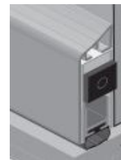
FM Face Mounted