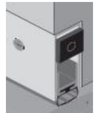
SR Semi Recessed